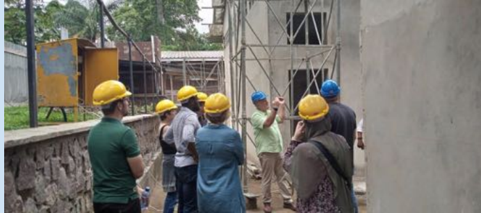
Current TASOK board members visiting the project site during their board retreat in November 2022

To know more about the projects and process, request an appointment with the project management team at business-2@tasok.net .