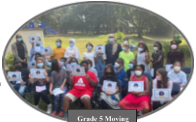
Grade 5 Moving Up Ceremony!

As we come to the close of the 2021/22 school year and the final day of school, I wanted to share this special summer farewell edition to celebrate our graduating class, recognize our departing faculty, and share my optimism for next year. I am very thankful for a successful school year of student learning, and looking forward to everything that 2022/23 has in store for us at TASOK!